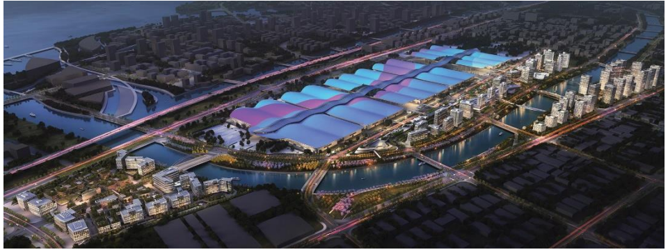
PCIM Asia 2021 venue: Shenzhen World Exhibition & Convention Center

2021 marks the 20<sup>th</sup> anniversary of PCIM Asia which will move to the brand new Shenzhen World Exhibition & Convention Center, from 9 – 11 September. The fair's relocation will create greater business opportunities for the power electronics industry within the South China region and beyond. Despite challenges resulting from the pandemic, the 2020 edition received positive feedback from both exhibitors and visitors, reconfirming the fair's position as one of the industry's leading trade platforms.